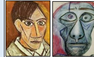
Self-Portraits: Aged 25 (1906) and Facing Death (1972)

-Picasso completed many, many self-portraits throughout his life, which reflected his constantly-changing style. -Aged 25, Picasso had already begun developing his trademark cubist style. The later 1972 portrait demonstrates a number of elements of surrealism that had found their way into his work.