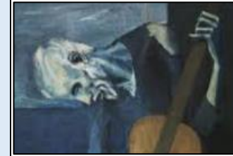
The Old Guitarist (1903)

- The Old Guitarist is perhaps the most well-known of the paintings from Picasso's Blue Period. -It was painted just after the death of his close friend, Casagemas. -It shows a thin, skeleton-like figure with distorted features. The brown guitar is the only shift in colour from the depressing blue tint throughout.